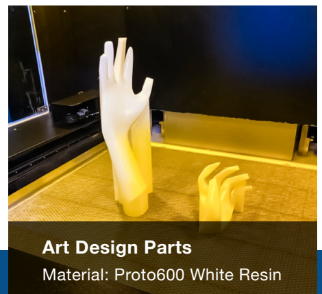
Art Design Parts